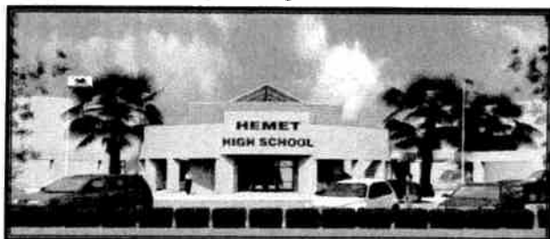
Hemet High Conceptual "Front Door" View